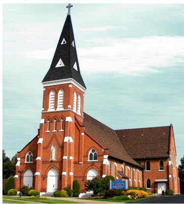
Saint Thomas the Apostle Church 203 W. Washington Street Corry, PA 16407