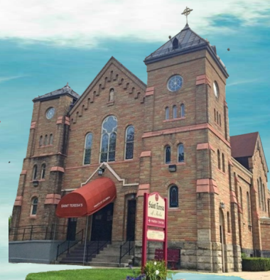
Saint Teresa of Avila Church 9 Third Avenue Union City, PA 16438