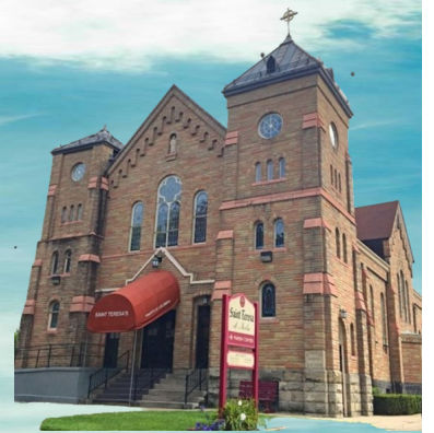
Saint Teresa of Avila Church 9 Third Avenue Union City, PA 16438