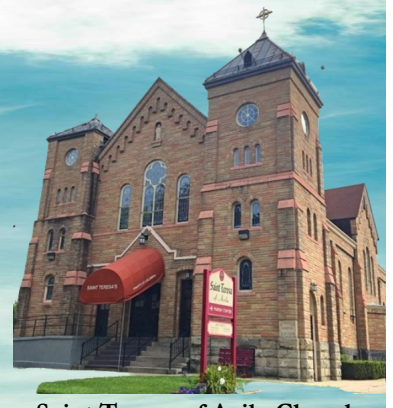
Saint Teresa of Avila Church 9 Third Avenue Union City, PA 16438